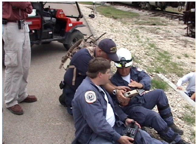
Figure 3: Spontaneous multi-operator, multi-robot cooperation in searching a train car. This illustrates the type of behavior targeted by the Human-Robot Team Effectiveness Incident Log and Rating Scale

Figure 3 shows an example of the type of behavior that can be captured with the Human-Robot Team Effectiveness Incident Log and Rating Scale (notably the Incident Log which allows for notation and classification of such sporadic and ad-hoc behaviors). The operator of the second robot, wearing the backpack, uses his video display to point out to the two operators of the first robot a compartment that they missed in their search pattern. Only the first robot was involved in the scripted exercise, but they had failed to locate all the targets in the train, until the second operator/robot (not part of the exercise, just practicing operating the robot nearby), was able to provide the expropriceptive viewpoint needed to locate the missed compartment and target.