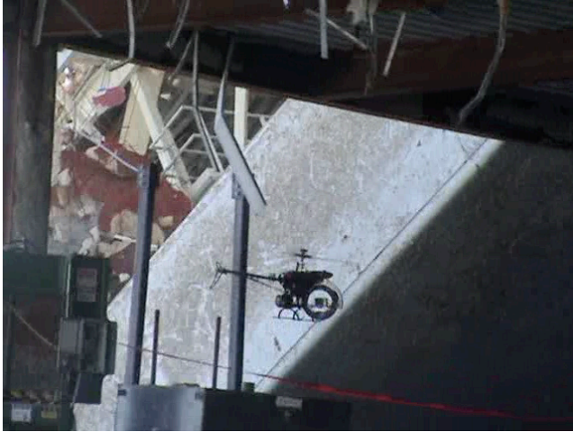
Figure 2: The sUAS helicopter entering a damaged structure to inspect an I-beam for structural integrity.

come to rest against the building). The frame also illustrates the hazard cluttered flight domains pose to the vehicle. Within 2m of the helicopter are: the roof, the floor, a trash compactor, two vertical steel beams, caution tape (additionally hazardous as a moving obstacle), and wires and ceiling tile supports hanging from the ceiling (also mobile).